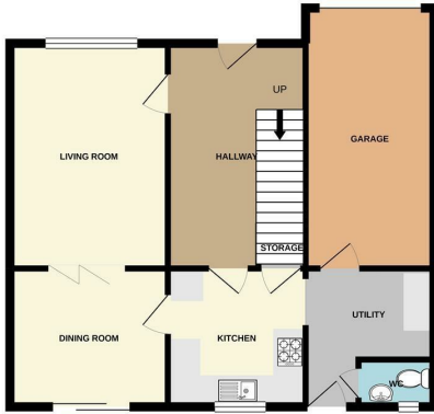
1ST FLOOR 451 sq.ft. (41.9 sq.m.) approx.